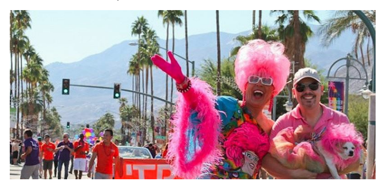
One Queen Room and One King Room Left!

At the end of the month a group from MAX will travel to the beautiful gay paradise of Palm Springs, California for a fabulous four-day getaway.