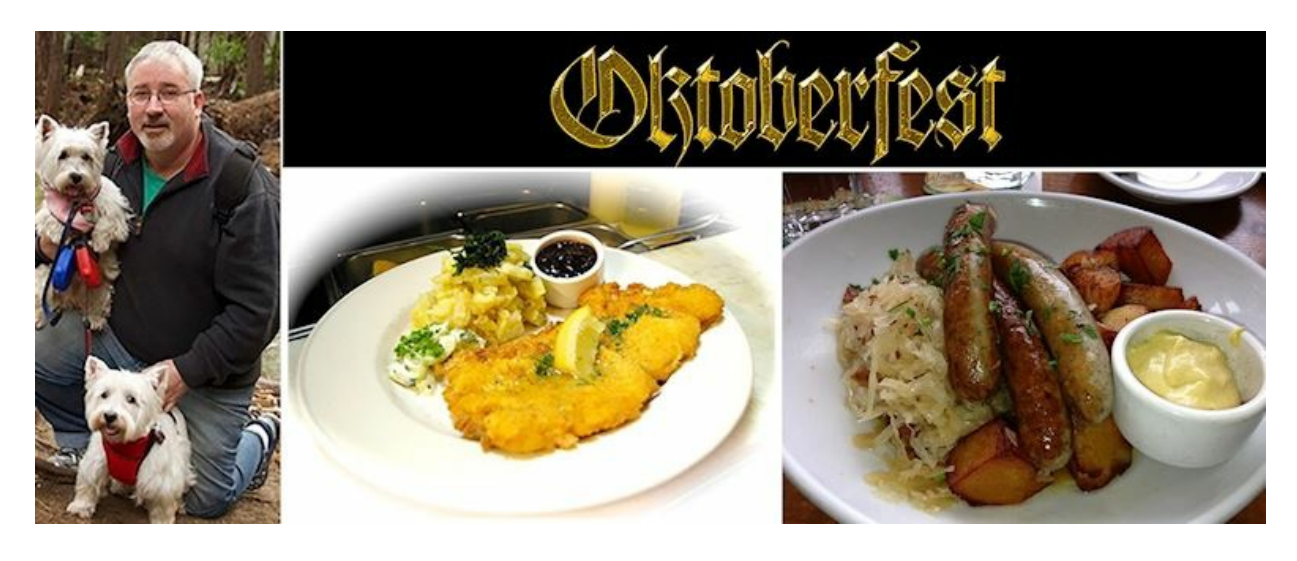
Watch the Blue Angels and Celebrate Oktoberfest!