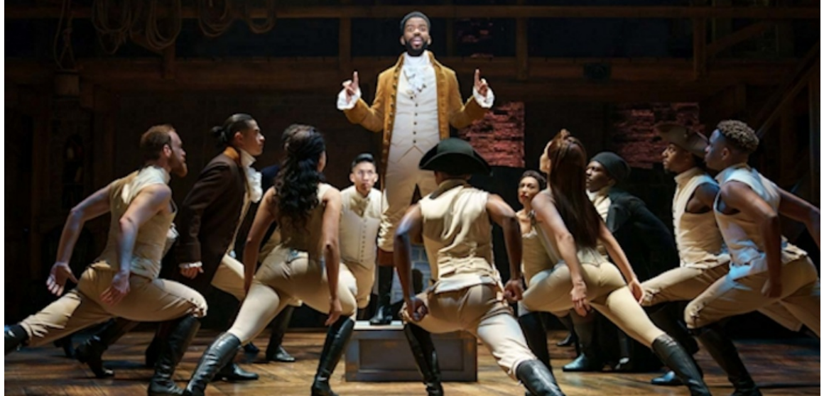
WINTER TICKET DISCOUNT OFFER - Just in time for the holidays!

BroadwaySF is now offering dues-paying members of MAX discounted tickets to performances of the musical and cultural phenomenon that is Hamilton .