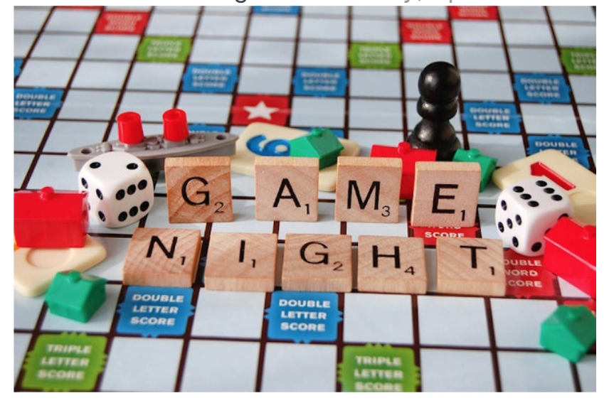
MAX SF Games Night Wednesday, April 24th at 6:00 p.m.

This month we're kicking off a new MAX event series, "MAX SF Games Nights".