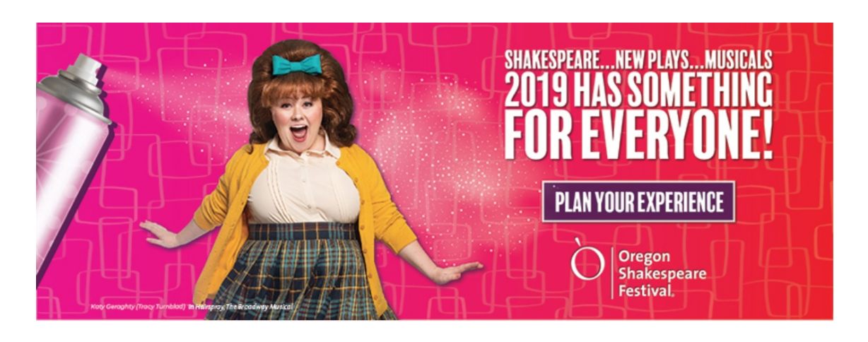
UPDATE: A Single Space Has Become Available!

This Memorial Day Weekend, a group from MAX will journey on a four-day getaway to beautiful Ashland, Oregon, and the Oregon Shakespeare Festival. The group will depart by van on the morning of Friday, May 24th and begin a journey that includes theater, wineries, magnificent nature and small-town charm.