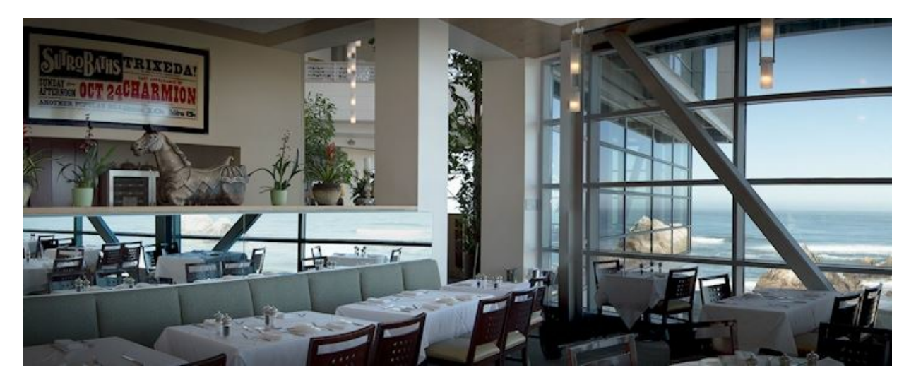
Only Three Spaces Left! Deadline to Sign-Up Friday, August 2nd

August Elegant Brunch : Sutro's at the Cliff House Saturday August 3rd at 11:30am