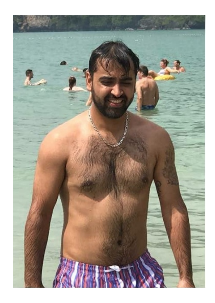
Eight Handsome New Friends

Between the Delhi airport and my hotel, my Scruff exploded! 8 "hello" messages from handsome gay Indians in their 30's. "What was going on" I thought. I had not been this popular since my 20's. Could they all be money boys? They weren't. They were real, nice, handsome, and charming. And they love older white gay Men. In fact, they call us "Caucies." To have a "Caucie boyfriend" is the best thing going. When I asked a young Indian friend why Indian gay guys like older white guys, he said: "In India, we revere age. We also love white guys. Older guys are kind, reliable, fun, and treat you nicely. So, we want you." I thought, "Hallelujah. My time has come!"