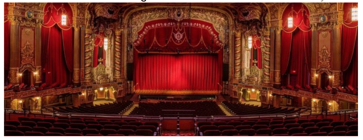
For MAX Members Only!

Discounted Fine Performing Arts and Theatre Tickets February 11th